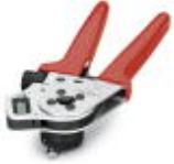
Crimping pliers with digital display

Crimping pliers with digital display - SF-Z0054 - 1615585