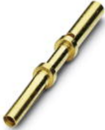
Crimp contact, turned, Contact diameter: 0.6 mm, Crimp range: 0.08 mm 2 ...0.25 mm 2

Please be informed that the data shown in this PDF Document is generated from our Online Catalog. Please find the complete data in the user's documentation. Our General Terms of Use for Downloads are valid ( http://download.phoenixcontact.com )